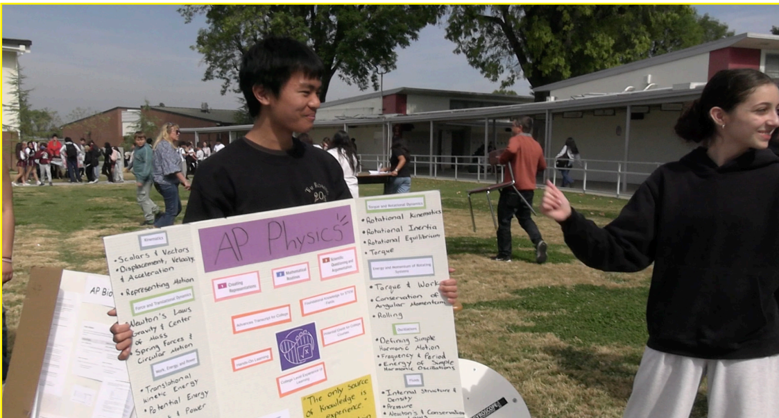
A student promoting AP Physics to students

Here at SOCES, there is freedom for students to choose electives besides those that meet graduation requirements. These classes are based on the students interests. SOCES often offers electives like Art, Music, Photography, Culinary, Computer Science, and Drama. Thus giving students the opportunity to try out different things and gain new skills.