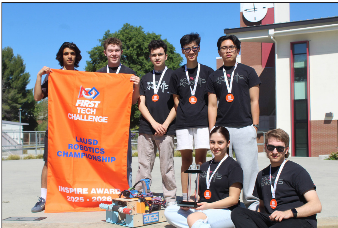
Photo of the Robotics Team with winning banner

Our school's robotics team consists of two teams: the #20625 Team, with around 8 students, and the #20626 Team with about 10 students, all ranging from grades 7-12. They have all been rigorously working since September to prepare for the FTC (FIRST Tech Challenge), a nationwide competition where students across the country compete head-to-head in different robotics challenges. FTC is an annual themed, alliance-based game, with the theme and prompt