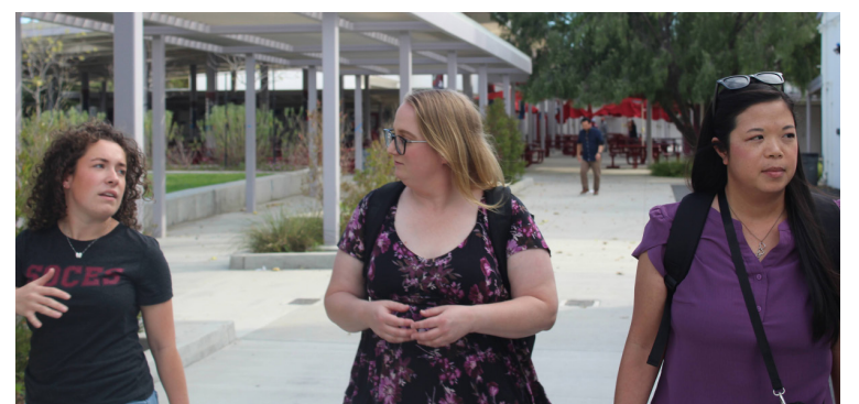
Photo of student showing WASC Official around campus

So, while we don't have an official accreditation decision yet, WASC has come to a conclusion that we have strong strengths, yet some weaknesses to work on. These weaknesses can easily be worked on and it appears our school has a very bright future.