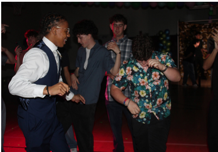
Photo of students dancing and posing at Spring Fling

Overall, this year's Spring Fling was a huge success thanks to the work and dedication of ASB. Their careful planning, creativity and dedication made the event such an achievement. It gave many students such a wonderful night and experience. All the effort and time ASB put into making this night very