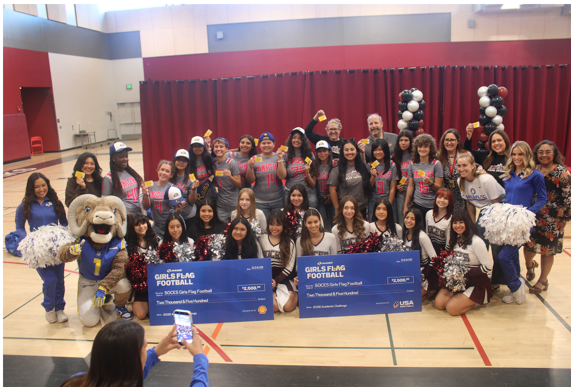
SOCES Flag Football, SOCES Admin, SOCES Cheer, and the LA RAMS